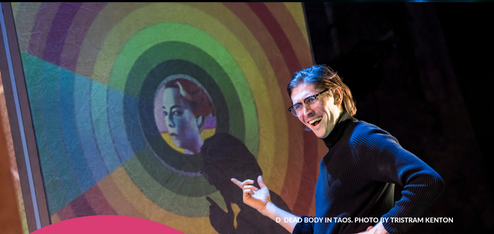
D DEAD BODY IN TAOS.