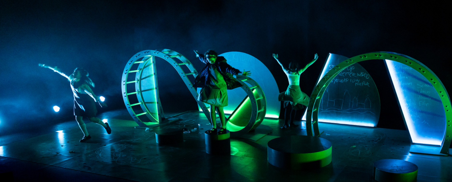
PROTEST AT NORTHERN STAGE.