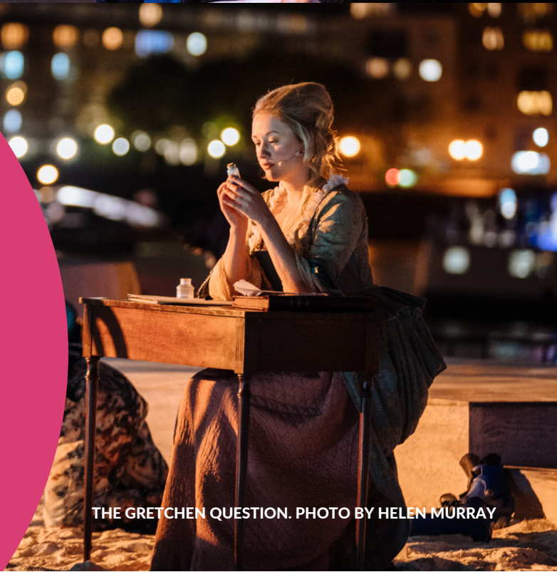
THE GRETCHEN QUESTION.

Fuel offers 10% of our work for free to groups who may not attend theatre otherwise. If you can, please consider giving a donation of £10 to support this, so we continue to deliver our courageous programme of work to the communities we engage with.