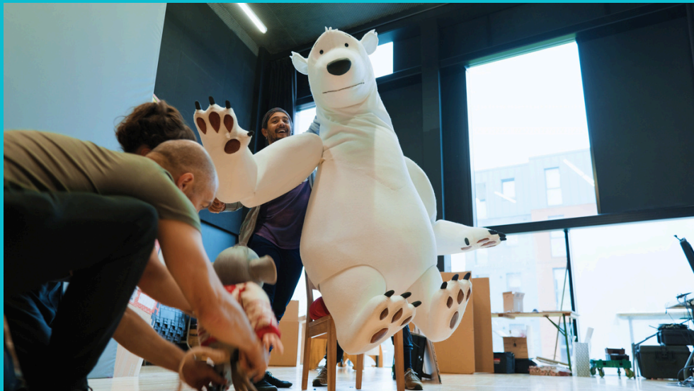
Bear and Mouse in rehearsals!