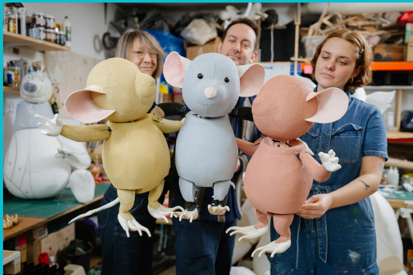
Mouse and Party Mice under construction!